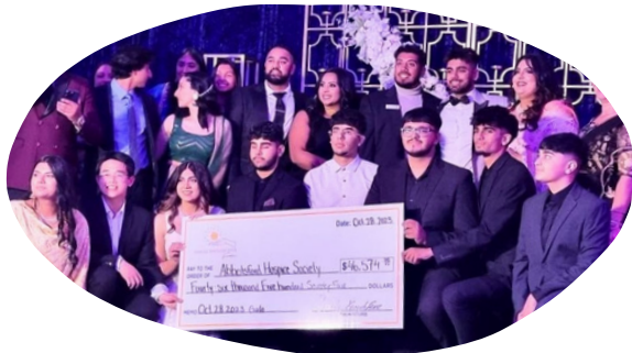
Photo above of Smiles Through Seva Foundation's 1st Annual Gala generously donating to AHGSS

We are committed to ensuring that every dollar raised is utilized effectively to further our mission and enhance the quality of care we provide. Looking ahead, we are optimistic about the future of our fundraising efforts. The positive trends observed in our major events and donor relationships suggest continued growth and success.