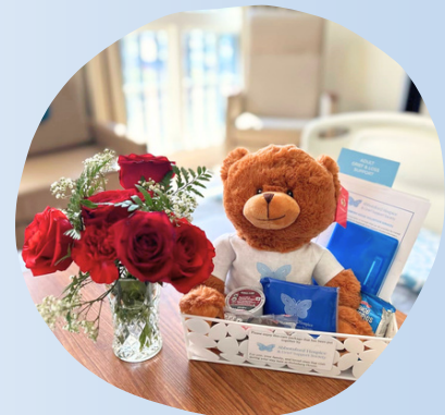
Photo above of a comfort care basket for palliative residents of Holmberg House