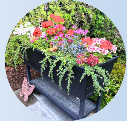
Photo above of a therapeutic garden for residents and families of Holmberg House and PCCU

Through our comprehensive palliative care initiatives, AHGSS remains committed to making a profound and enduring difference. By providing compassionate support to individuals and families during some of their most challenging moments, we help to cultivate a community that values empathy, understanding, and connection. Our services not only ease the burden of those facing terminal illness but also educate and empower the broader community to approach end-of-life care with sensitivity and respect, fostering a culture of compassion and shared responsibility.