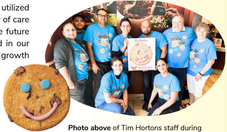
Photo above of Tim Hortons staff during Smile Cookie week campaign April 29 - May 5, 2024

We extend our heartfelt gratitude to all our donors, sponsors, community supporters, and volunteers whose unwavering support has made these achievements possible. Together, we are making a meaningful difference in the lives of those affected by grief and loss, and we look forward to continuing this important work in the years to come.